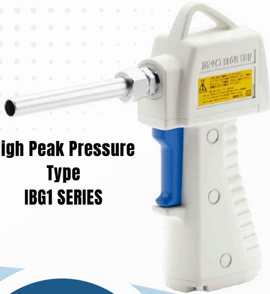
High Peak Pressure Type IBG1 SERIES