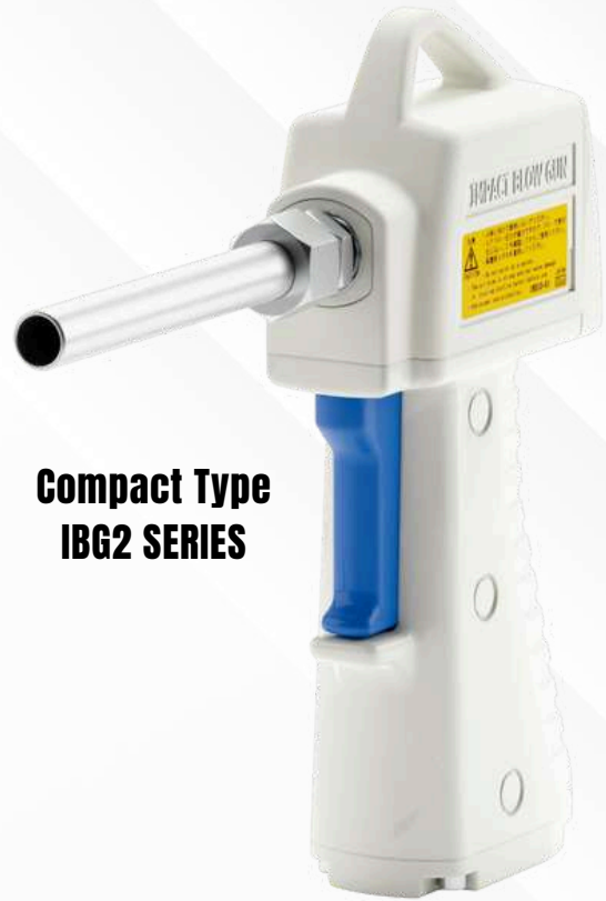
Compact Type IBG2 SERIES